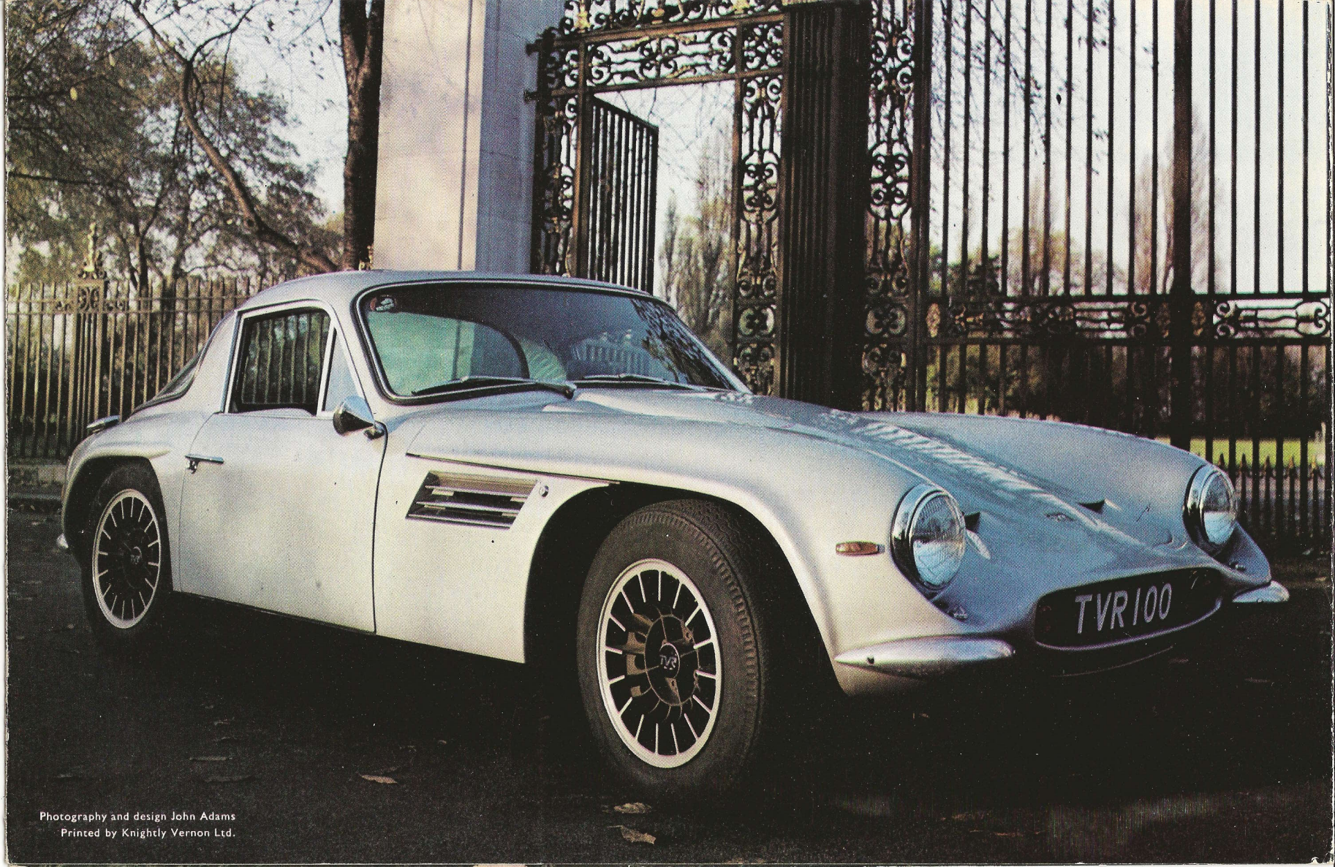
Printed by Knightly Vernon Ltd.